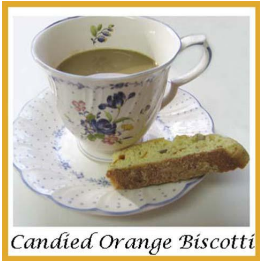
Candied Orange Biscotti