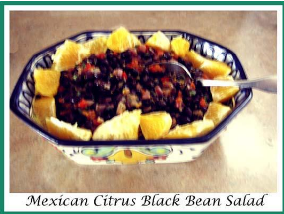
Mexican Citrus Black Bean Salad