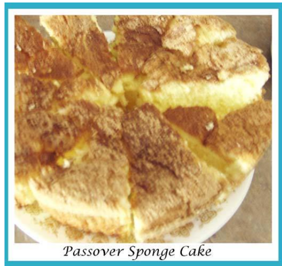
Passover Sponge Cake