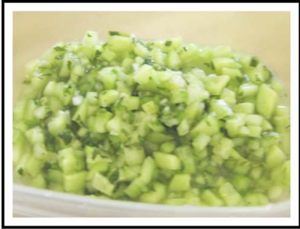
Lime Cucumber Mint Salsa